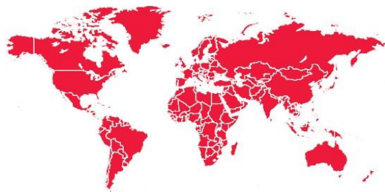
One member firm per Country

BDO is a leading professional services organisation and are global leaders of the mid-tier, with a presence in 167 countries and over 88,000 people working out of more than 1,800 offices. We endeavor to deliver truly exceptional client service through a tailored solutions approach, while partnering with our employees and clients globally