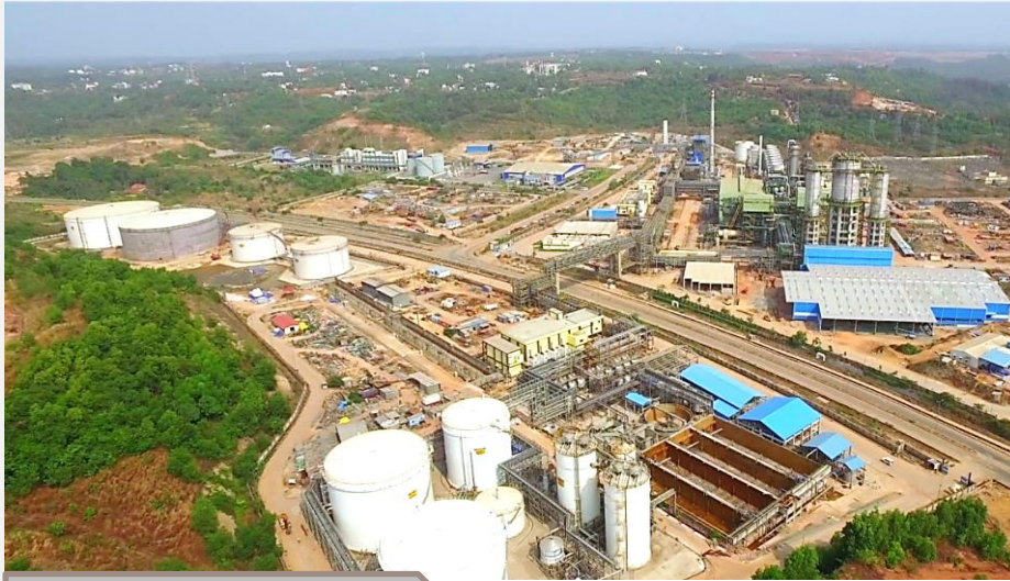
Overall plant view